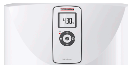
SNE 5 Premium Display